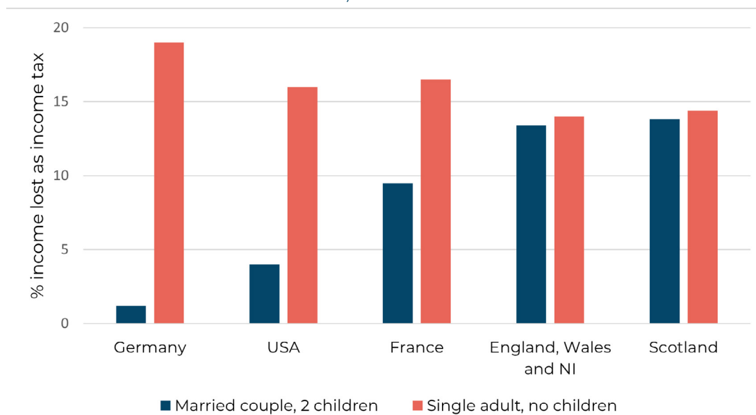
FIGURE 3: INCOME TAX AS A PERCENTAGE PAID OF AVERAGE WAGE IN 2021 IN GERMANY, FRANCE, THE US AND UK

The chart below compares the income tax paid by married couples with two children with that paid by single adults without children in Germany, France, the USA, and the UK, all of whom are earning the relevant average wage for the country in question, as measured by OECD in 2020 (latest available figures). 13 This is similar to the ONS figure for mean full-time earnings.